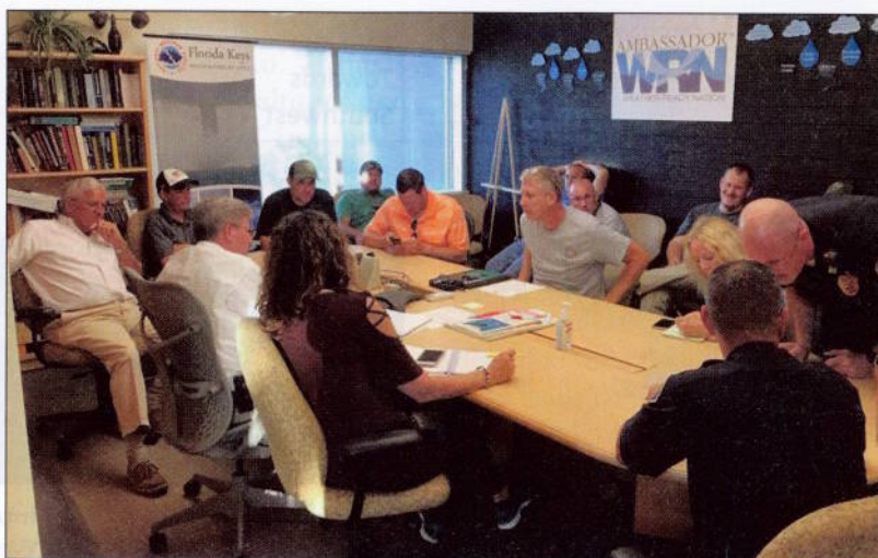
Emergency operations. In addition to weather service operations, WFO Key West also became the command center for Monroe County emergency management.

The office had three phone lines that never went down in the storm. Key West City Hall is located across the street and in the days after Hurricane Irma federal, state, and local officials (including both the mayor and city manager of Key West) came over to the office several times a day to get weather updates and participate in county coordination meetings and conference calls to make critical decisions. This face-to-face collaboration was critical to support core partner decisions such as when to reopen the Keys to residents, when to open the airports, power and water restoration, and determining the hardest-hit areas where most resources needed to be focused. Management at WFO Key West stayed in close contact with both regional and national headquarters in the NWS to keep leadership updated on the