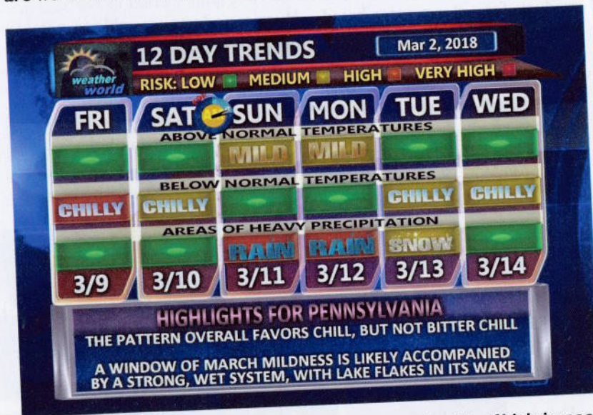
12-day trends. A checkerboard approach conveys the risk of high-impact events farther into the future.

The new of the ult total UV r UVB and than alte digital sig