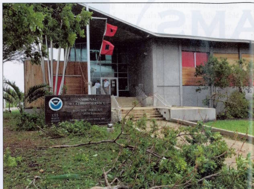
NWS Key West. The WFO in the Florida Keys after Hurricane Irma.

The uniqueness of the WFO’s Saffir–Simpson Category 5 hurricane-hardened facility enabled