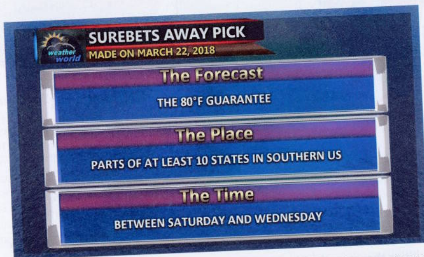
SureBets. These medium-range forecasts focus on anomalous events and are worded to be easily verified.

The general increase of forecast uncertainty with lead time necessitates that weather predictions be presented in varying formats. Through its variety of forecast products—many verified on-air—Weather World attempts to educate its viewers on the scientific